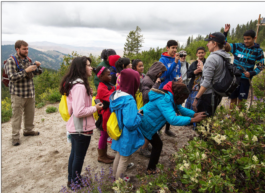
New Roots participants go on a field trip in the Boise Foothills.

In addition to the experience and learning activities, we also tapped into the arts and played many games to have fun. We had the children write in journals, invent and create a “new species” – a fun and creative activity – participate in folding passenger pigeon origami for “Fold the Flock” (see foldtheflock.org for more on this project), and more. In part of the program that was