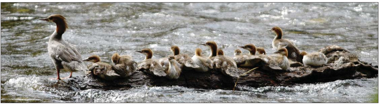
Merganser nursery in the Boise River.

Until further notice, the board will meet at the Sage School on Park Center Boulevard.