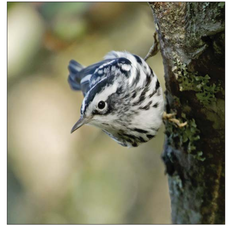
Black and white warbler.

Each morning at 6:30, after coffee, fruit and warm homemade muffins, we headed down the road through the village, stopping at the marsh, the grove of lilacs and ending up at the ice pond. On our first trip to the pond, we saw both yellow-crowned and black-crowned night herons. The routine stayed pretty much the same; early morning birding followed by a hearty breakfast and then more birding until lunch. After a brief afternoon break, we headed out along one of the many trails along Monhegan, usually to the east side and its many ocean vistas and rocky cliffs. It was on an afternoon hike to the lighthouse that Bryan found the fringed gentian, my target species.