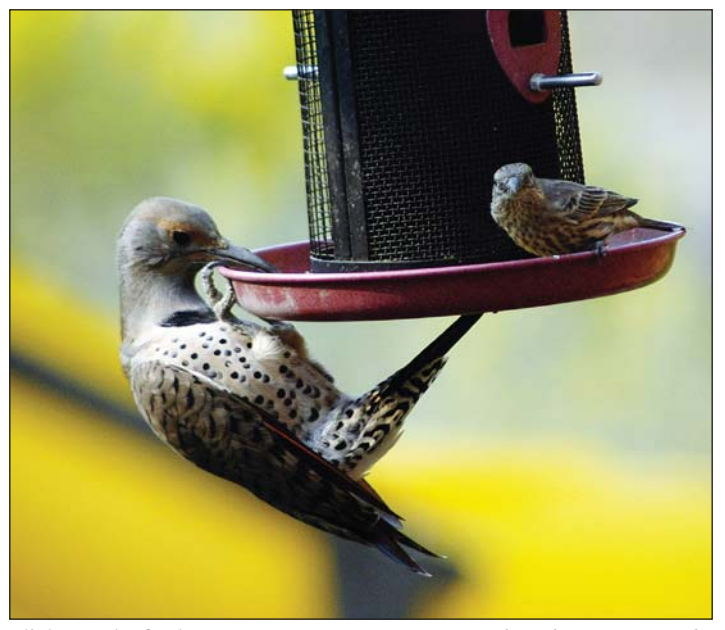
Flicker at the feeder.

We moved from California to the back side of the Boise foothills on Halloween 2011. I hung bird feeders outside the kitchen window and threw seed out for the quail. Soon the Grim Reaper, in the form of a Cooper's hawk, brought daily terror from above. One slow bird would pay the ultimate price, the Reaper would