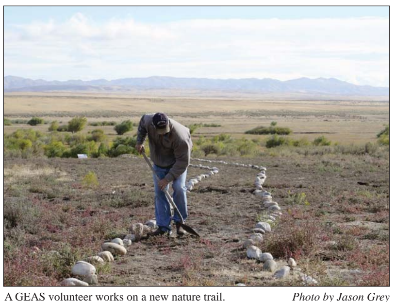
A GEAS volunteer works on a new nature trail.

now 600-plus acres of protected habitat, was known as a no man's land where illegal and destructive activities were pervasive. Since 2008, GEAS and 21 partner organizations, agencies, clubs and schools, totaling more than 300 individual volunteers, have worked diligently to change the way the area was managed, to clean up loads of trash, to change opinions, designations and appreciation for the area, and ultimately to protect the site from continued degradation while restoring habitat for wildlife and services for