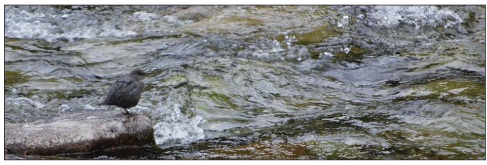
American dipper contemplates the North Fork Big Wood River.

even an odd blue jay in Boise. Your data is important, and you'll receive a copy of Winter Bird Highlights the following fall that summarizes all the data from the regions. A small fee is collected—$18, or $15 for Cornell Lab members—to cover the materials and support for the program. Project Feederwatch runs from November 12 through April 7 next year. Visit <a href="www.feederwatch.org/about/how-to-participate/">www.feederwatch.org/about/how-to-participate/</a> to learn about the program and sign up.