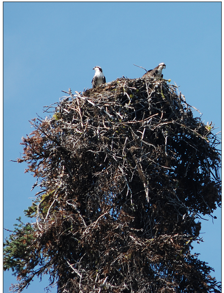
Two fledgling ospreys near Cascade Lake

Reply or questions: https://www.goldeneagleaudubon.org/event-3109134 . Sign-up at www.goldeneagleaudubon.org .