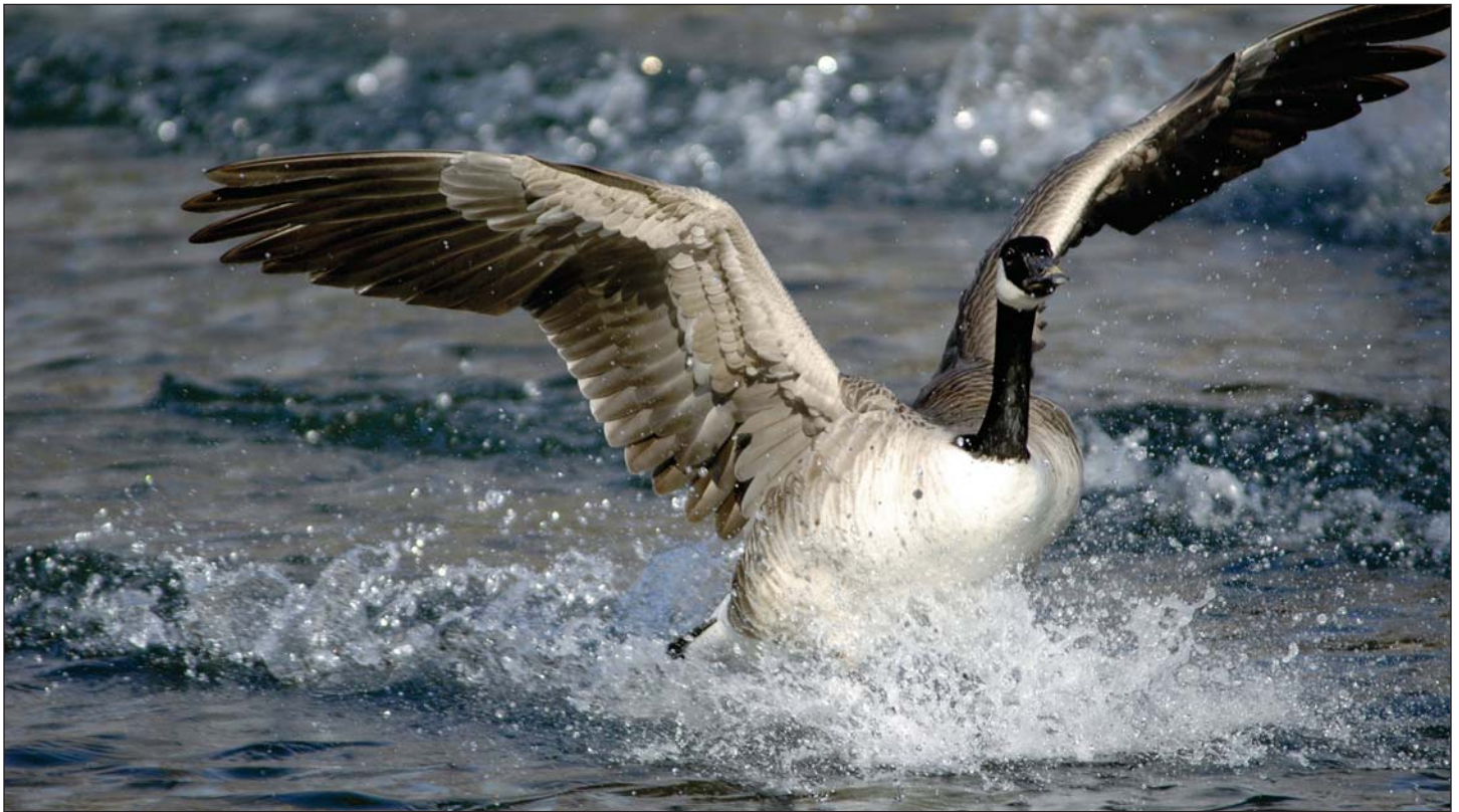
Canada goose touches down on the Boise River.