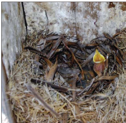
Hungry bluebird baby

our wilderness areas, poisoning elephants to collect their tusks, or allowing their pet cats to cause mayhem in the local bird population. Humans evolved on this planet; we have a right to be here. But so do all the other species,