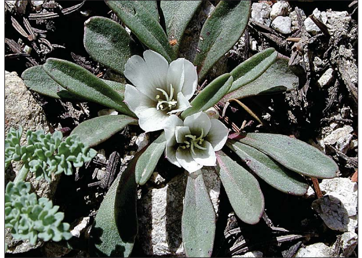
Sacajawea's bitterroot ( Lewisia sacajaweanana )

resources. This is a big project and it needs to follow our laws that protect our environment. We will continue to fight this project which we feel is inappropriate for the Boise River watershed.