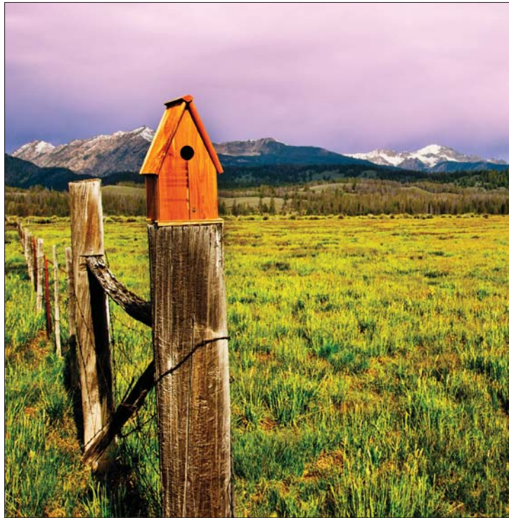
Bird house on the road to Pettit Lake