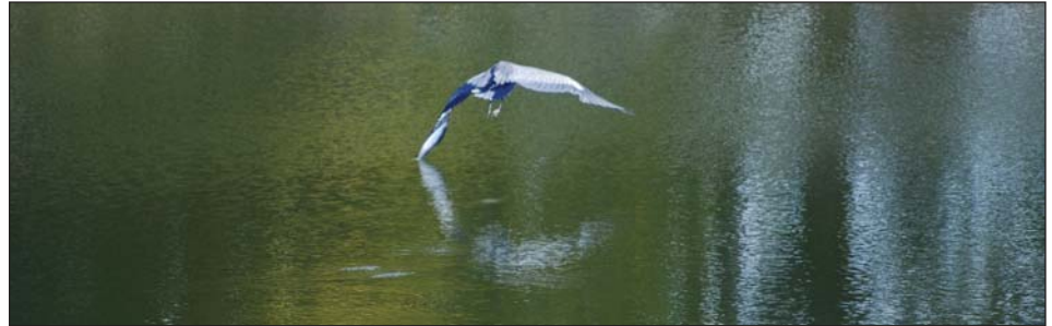
Great blue heron takes wing.